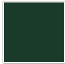
Roycroft Bottled Green